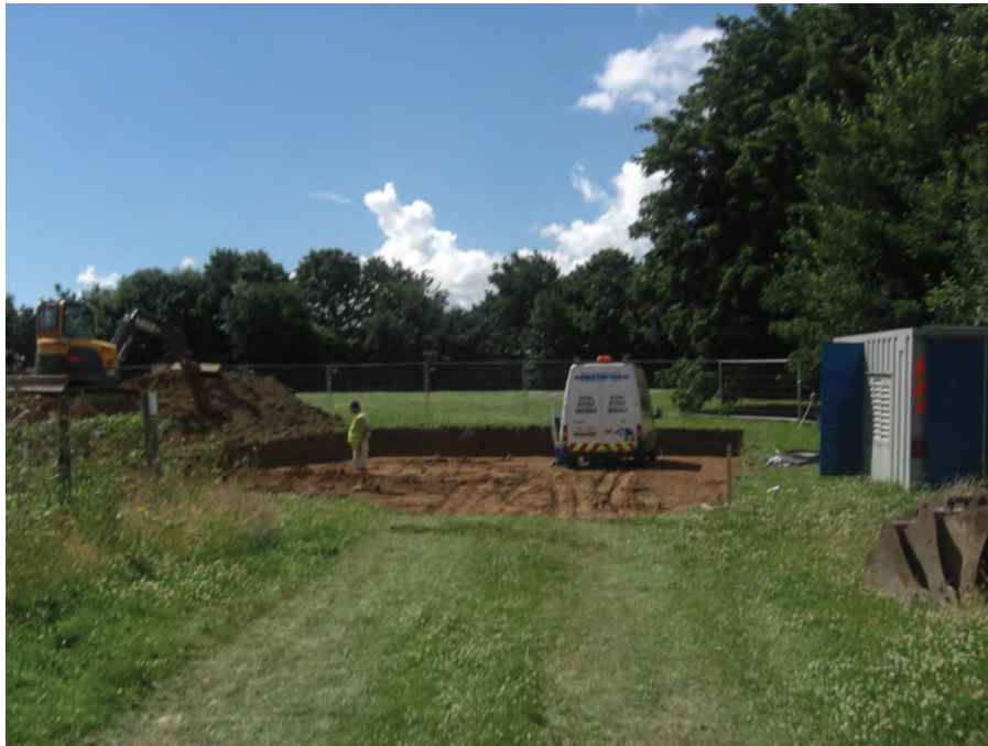
Fig. 3: The site, looking south