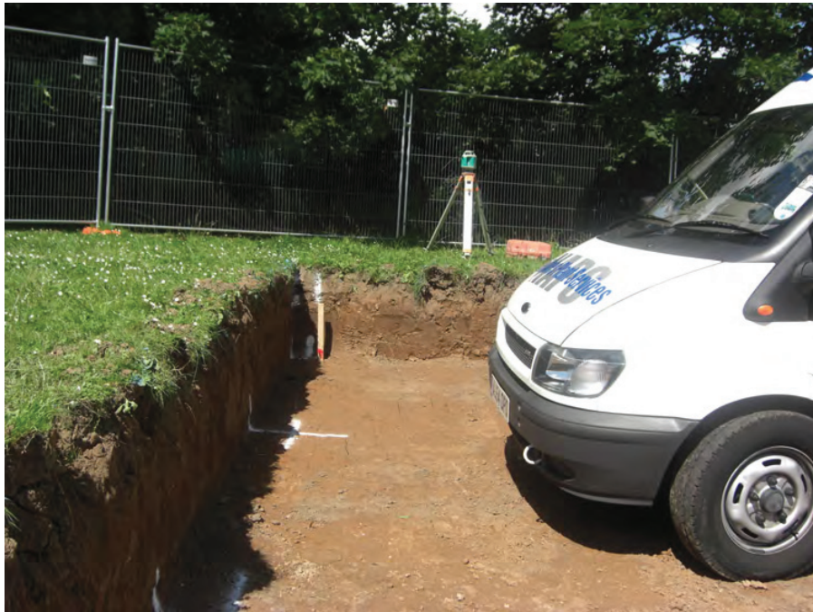
Fig. 4: Southern profile