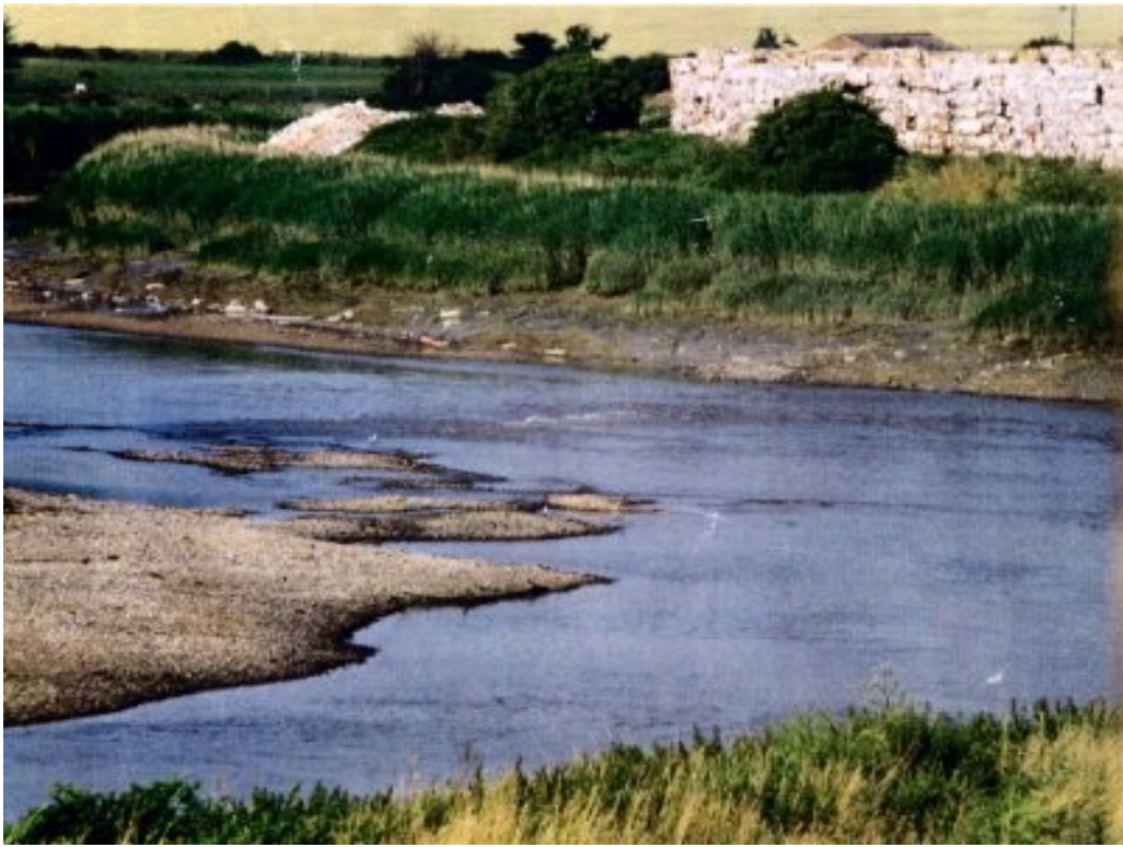
Top: Snodland Rocks