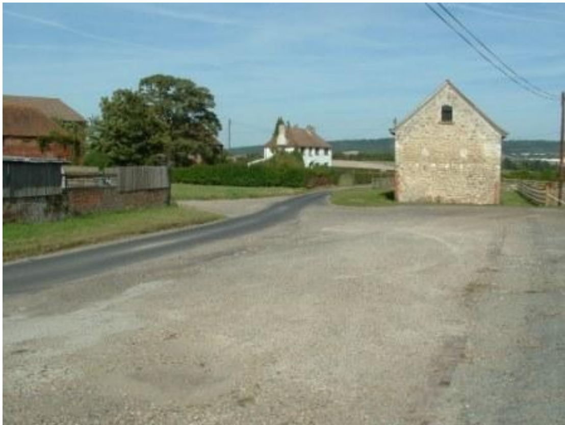
Paddlesworth Farm, Paddlesworth Road looking towards Snodland

Goodsall, in The Ancient Road to Canterbury (1955) concedes that, whilst the part of the trackway lying across the western portion of the county may have been used as a pilgrimage route, he repeats the doubts expressed as to whether pilgrims would have continued along the southern flank of the downs. Whilst suggesting that the trackway east of the Medway may well have been used as a long distance route for the purpose of transporting chalk from the many chalk pits found along the southern flank of the downs, he nevertheless doubts its use as a thoroughfare for pilgrims. Goodsall argues that: