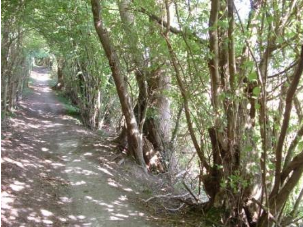
Terrace-way, Pilgrims' Way near Trottiscliffe approach to Medway Gap

'... that there is a good deal of evidence of a negative kind to disprove its use by pilgrims, at all events from the Medway crossing to Canterbury'. 23