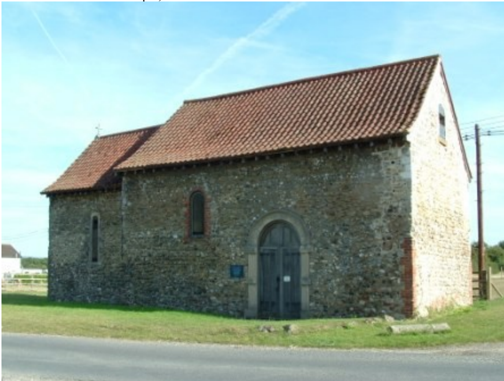
Bottom: St Benedict's Chapel, Paddlesworth