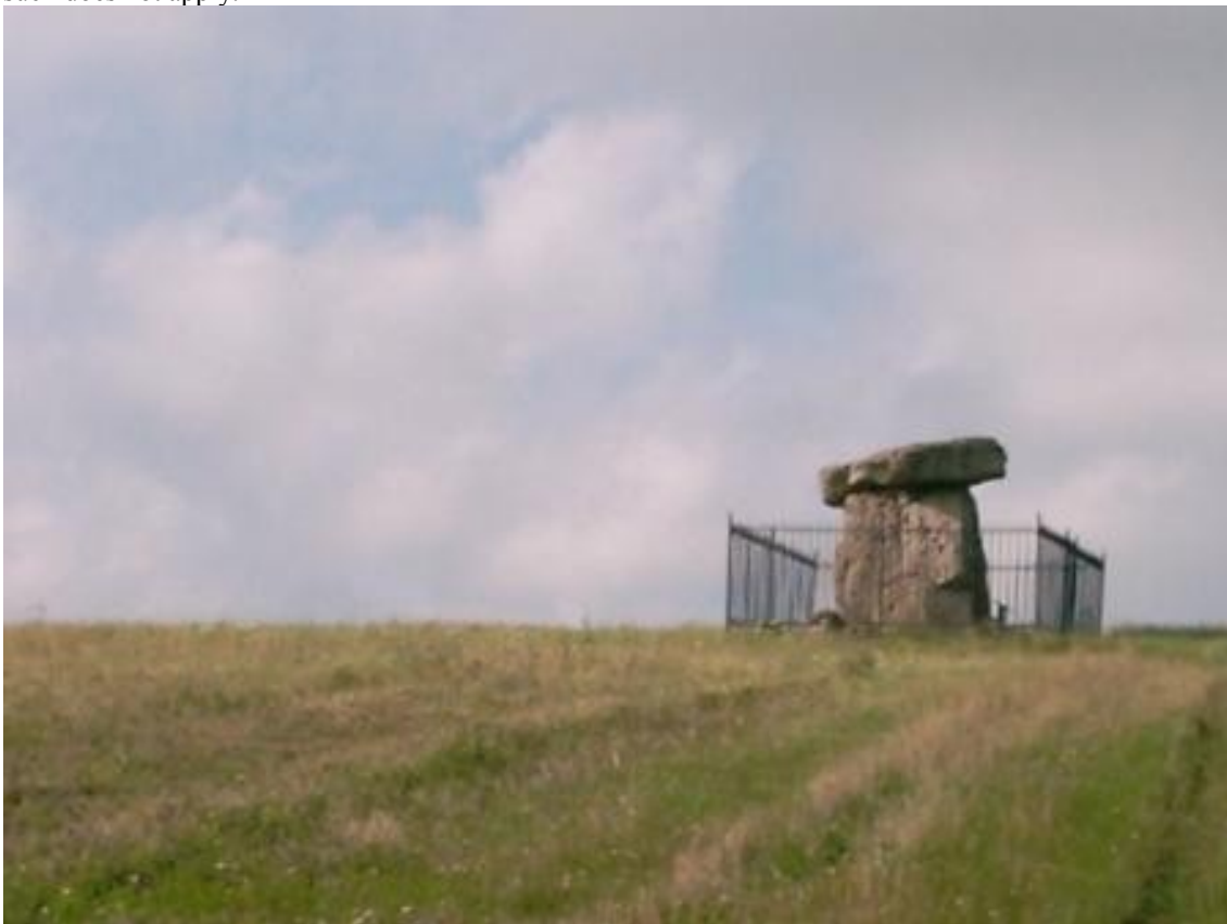
Kits Coty House situated on the east bank of the Medway Gap

Belloc also argues that the Horseshoe reach at Snodland is favored because it is the upper limit of where the sea town (Rochester) has jurisdiction over the lower Medway. He suggests that this is always the traditional crossing point of a river. Again, this factor is of no relevance to the prehistoric traveler and as such does not apply.