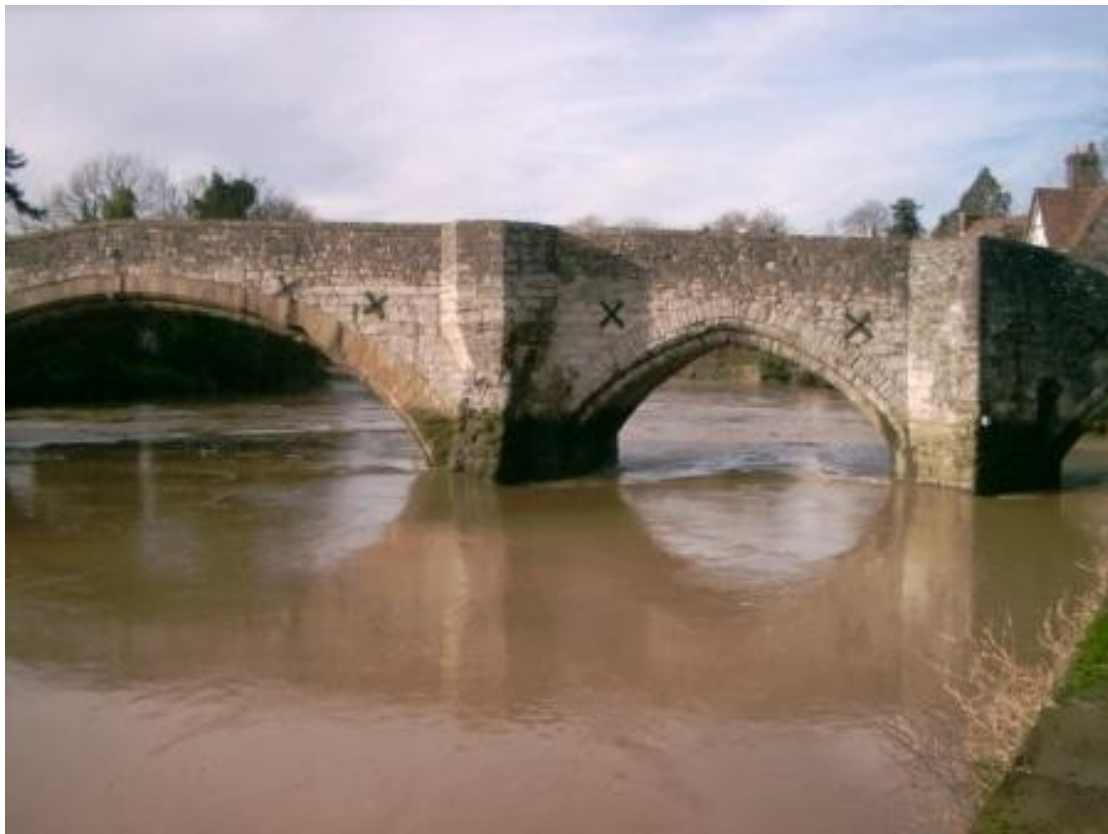
Top: Medieval bridge at Aylesford Bottom: Coldrum Stones, Pilgrims' Way near Trottiscliffe