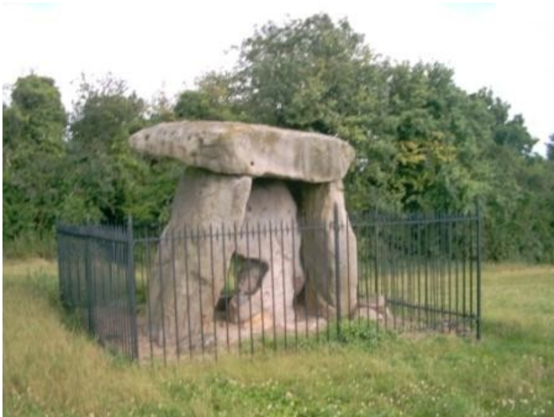
Kits Coty House